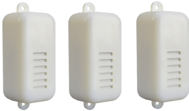
Available in Black or White